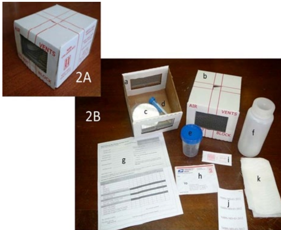
Figure 2A: A live bee shipping box which contains (Figure2B) all the materials needed to collect and store and ship samples in one apiary.

Figure 2B: Contents of a live shipping box (a) main box and (b) box lid, (c) Petri dish glued to shipping box floor containing queen candy, (d) capped 15 mL tube filled with water and a sponge, (e) 1 small (125 mL) bottle with alcohol (for Tropilaelaps sample), (f) 1 large (500 mL) bottle with alcohol (for Nosema/Varroa sample), (g) data sheet, (h) mailing label, (j) set of 4 stickers with identical Identification numbers, and (k) cloth filter.