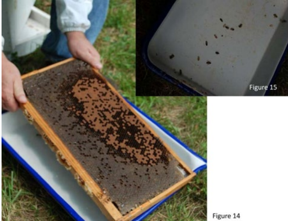
Figure 14: Hold brood frame (from which bees have been removed) above metal collection pan, with one frame surface facing down. Firmly knock the frame over the metal collection pan by allowing one end bar to hit the metal collection pan.