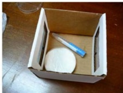
Figure 4: To ensure queen candy does not dry out before use, it has been sealed in the petri dish. Remove wax paper before placing bees into the live shipping box.