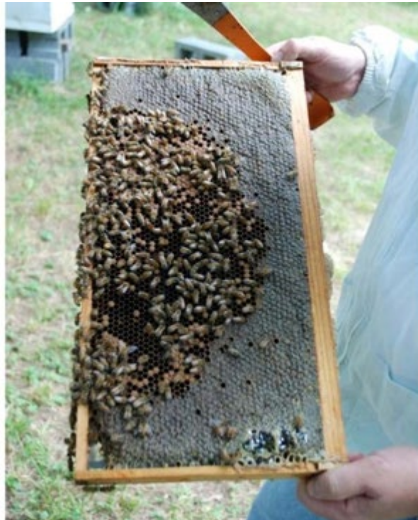
Figure 7: A frame containing sufficient adult bees, uncapped and capped brood for sampling.