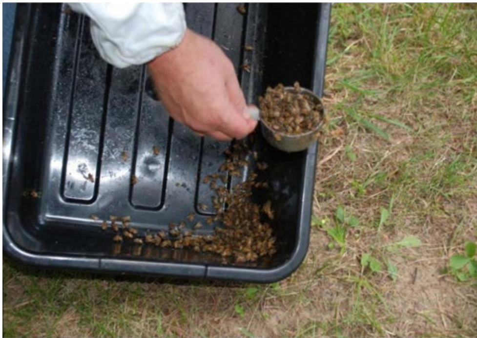
Figure 10: A brimming \frac{1}{4} cup of bees.