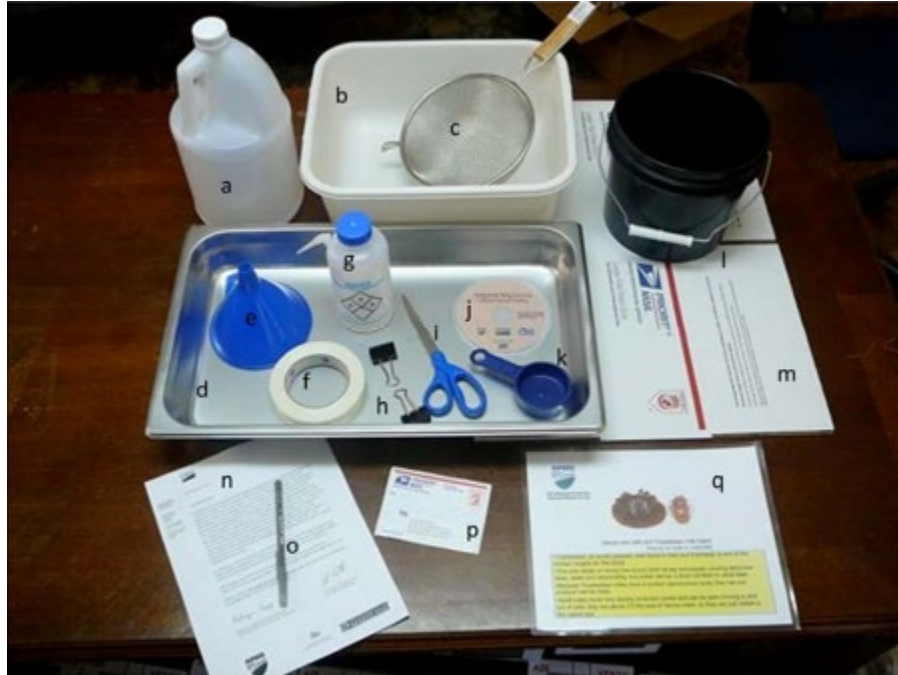
Figure 1: Reusable equipment needed for sampling apiaries. Materials include (a) 1 gallon bottle (to be filled with water), (b) wash tub, (c) strainer, (d) metal pan, (e) funnel, (f) clear binding tape, (g) squeeze bottle (to be filled with water), (h) binder clips, (i) scissors, (j) training video, (k) ¼ cup measuring cup, (l) bucket, (m) 3 large Priority Mail flat rate boxes, (n) letters explaining the purpose of this sampling (a copy of this should be given to cooperating beekeepers), (o) pen, (p) 3 preaddressed mailing labels, (q) Tropilaelaps information sheet.

Also needed are basic beekeeping protective equipment (coveralls, veil, etc.) and beekeeping tools (smoker, hive tool etc.) which are not provided.