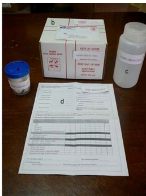
Figure 3: Place identification sticker onto (a) data sheet, (b) large bottle, (c) small bottle, and (d) mailing box.