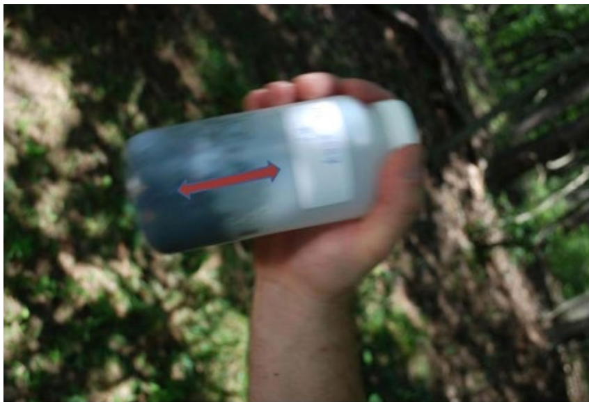
Figure 16: Close the large sampling bottle containing 2 cups of bees (1/4 cup from 8 different colonies), tightly seal the lid of the container, and tip the bottle several times to ensure all bees are damp with alcohol.