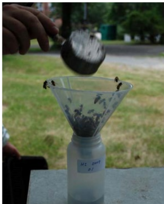
Figure 13: Place a second \frac{1}{4} cup of bees into large bottle of alcohol.